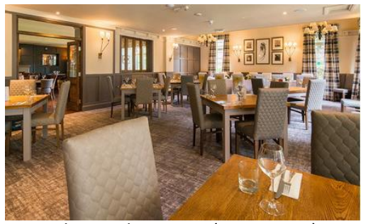
The Garden Room (Private use)