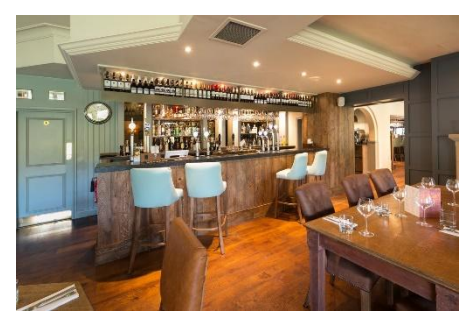
The Garden Room Bar