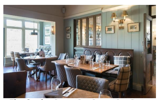
The Garden Room Bar Reception Room